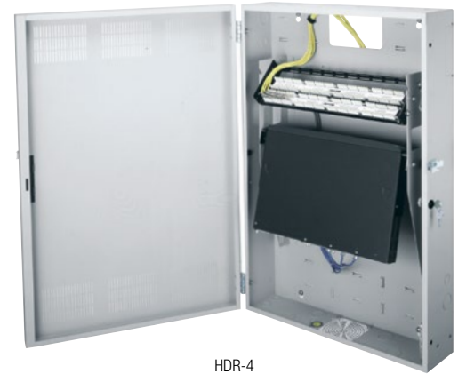
HDR-4 shown with equipment in service position